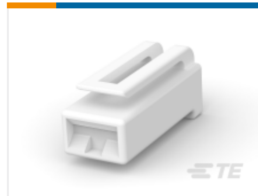
TE Part # 521743-1 FF 250 HOUSING RECEPTACLE NYLON 6/6