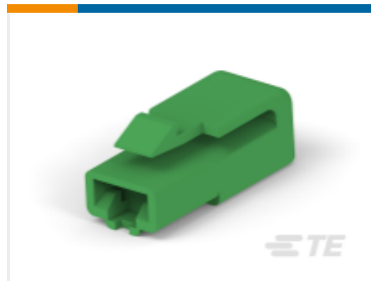
TE Part # 176987-4 FF 250 PLUG HSG 1P NYLON GREEN