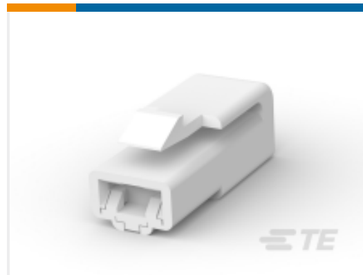
TE Part # 176986-1 FF 250 PLUG HSG 1P NYLON NAT