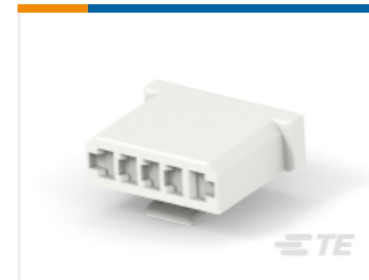
TE Part # 880192-1 5W FASTIN-ON REC. H