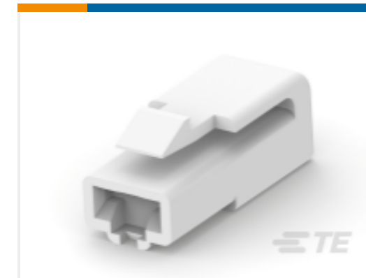
TE Part # 176987-1 FF 250 PLUG HSG 1P NYLON NAT