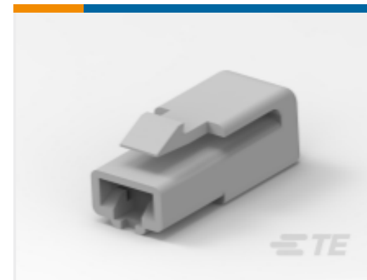
TE Part # 176987-6 FF 250 PLUG HSG 1P NYLON GRAY