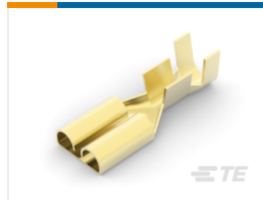
TE Part # 170258-1 FF 250 REC 14-12AWG BR REREELING