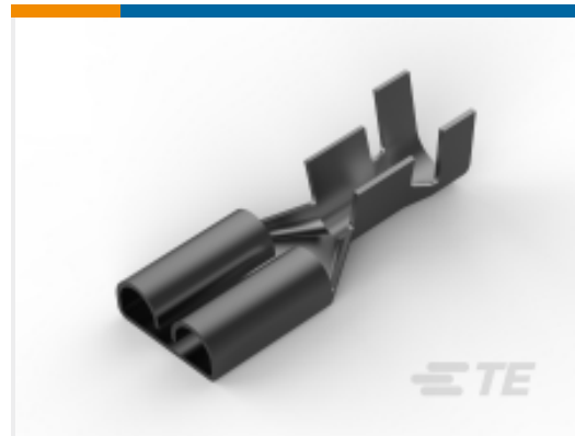
TE Part # 170258-2 FF 250 REC 14-12AWG TPBR REREELING