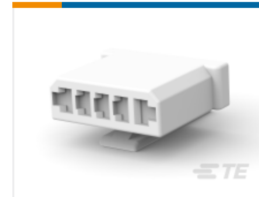
TE Part # 880192-2 5 WAY FF 110 HSG REC NYLON 66 NATURAL