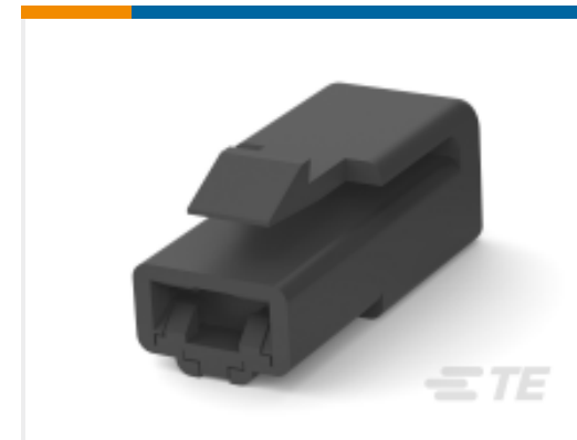
TE Part # 176986-2 FF 250 PLUG HSG 1P NYLON BLACK